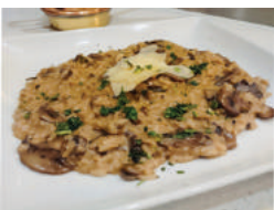
Risotto Funghi al Tartufo