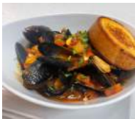
Mussels & Clams

Soup of the Day (Ask your server for details) ... $8.99