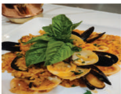
Risotto Frutti di Mare