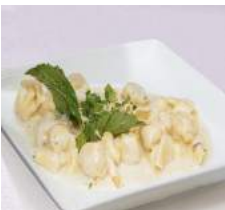
Fiocchi di Pera al Tartufo